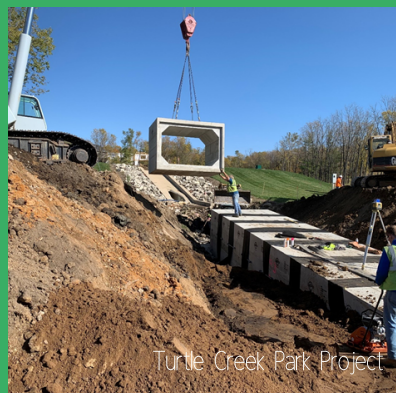
Turtle Creek Park Project