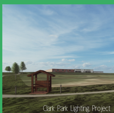
Clark Park Lighting Project

The City Council approved a contract with Eastern Iowa Construction from Cascade to install new trails and sidewalks on the western end of Boyson Road as well as within Guthridge Park. In addition, sidewalk ramps along Emmons St were replaced to bring them up to code with the American with Disabilities Act. All work has been completed for each of the sites. Site restoration has been completed but due to the late season, some areas may need to be touched up in the spring. This project wrapped up in October 2020 at a cost of $220,000.