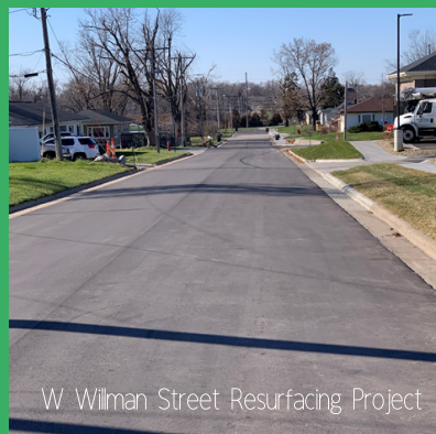
W. Wilman Street Resurfacing Project