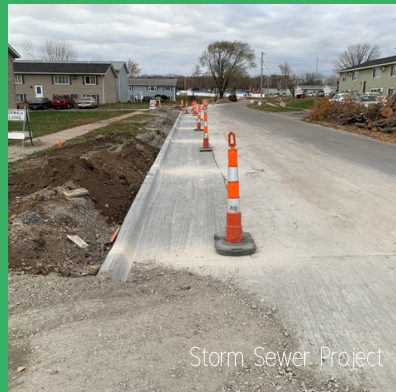
Storm Sewer Project