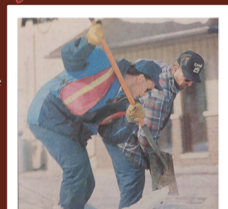
Maintenance workers collaborate to break ice around storm sewer Winter of 1994

Read more about the history of Hiawatha by purchasing your own copy of "Hiawatha, 70 Years of History" at the Hiawatha Library.