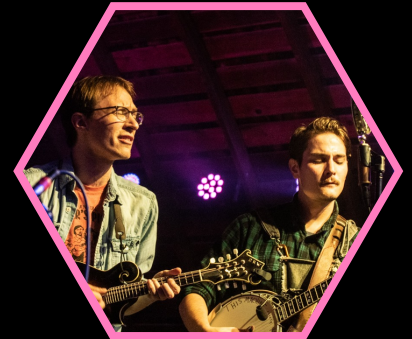
September 15th Dodge Street Duo