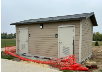
Restroom at Turtle Creek Park

Northwood/Nixon Crosswalk - This summer, a new sidewalk was installed on the south side of Northwood Drive from Robins Road east to Nixon Drive. Likewise, the City replaced the sidewalk on Nixon Drive, from Northwood Drive up to Nixon Elementary. The new sidewalk crossing at Nixon Drive, provides a safe pathway for all pedestrians, especially with the amount of traffic that travels along Northwood Drive.