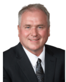
MAYOR BILL BENNETT