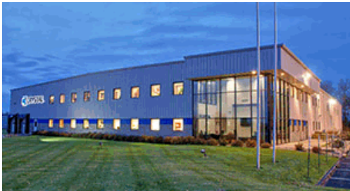
The Crystal Group had a growth rate of 108.6% and appeared on the list for their third time.