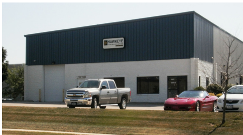
Hawkeye Communications/Fandel Alarm had a growth rate of 75% and appeared on the list for their first time.