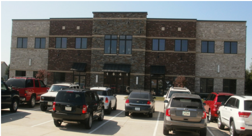
Compass Commercial Services was in the #2 spot with a growth rate of 224.8%. This is their second time on the list.

To earn a spot on the list, businesses had to meet a number of criteria. First, companies had to earn at least $350,000 from 2010 - 2012. Those companies had to submit three (3) years of tax forms or audit statements to Honkamp Krueger & Co., a Hiawatha-based accounting firm, which independently tabulated the results. The winners were selected based on their growth. Congratulations to Compass Commercial Services, Midwest Microwave Solutions Inc., Mobile Demand, Crystal Group, Hawkeye Communications/Fandel Alarm, and CEC Communications. We are honored to have each of these companies as a part of our community business district. Our business community is the backbone to our city's steady growth and it has been an honor to partner with many of these companies.