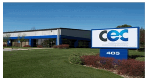
CEC Communications Engineering Company appearing on the list for their first time.