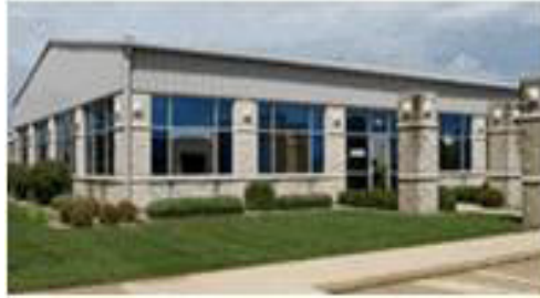
Midwest Microwave Solutions Inc, with a growth rate of 176.2%, also their second time on the list.