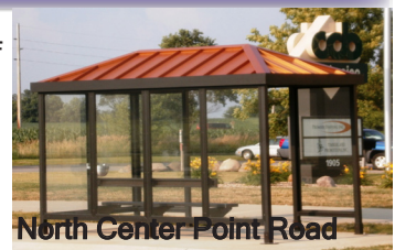
North Center Point Road

It is through great partnerships that great things happen! The "Better Block Bus Shelter Installation" Program exists because of those partnerships. The City Council thanks Kirkwood Community College, Ahmann Design and CCB Packaging for their donation to this program and is appreciative of their partnerships with the City.