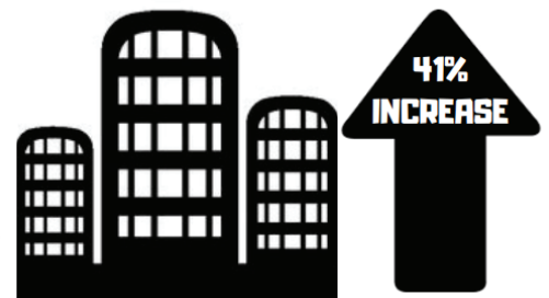
Annual New Building Construction Value since 2015