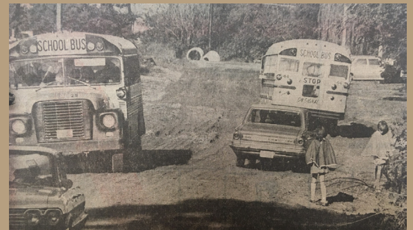
THESE students are pictured walking in Northwood drive, the only access to Nixon school at present. The school bus and the cars illustrate the traffic problems in the road, which is muddy after a moderate rain. The street is to be closed for paving.

The caption reads: "The students are shown walking in Northwood Drive, the only access to Nixon School at present. The school bus and the cars illustrate the traffic problems in the road, which is muddy after a moderate rain."