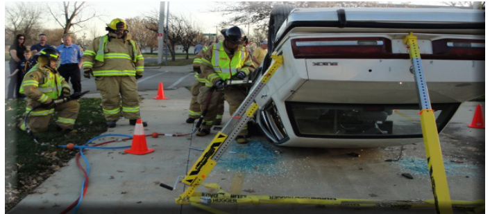
Firefighters demonstrate extrication equipment.