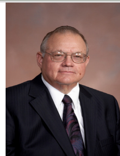
Tom Theis Mayor