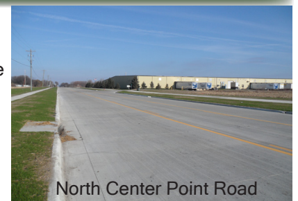
North Center Point Road

North Center Point Road was fully reopened to traffic on Monday, November 7, 2011. Please use caution as you drive through this area as work will continue on the sidewalk and trail just off the road for the next several weeks. Stamy Road was fully reopened to traffic on Monday, November 21, 2011. Thank you for your cooperation in these lengthy and worthwhile projects, we appreciate your patience.