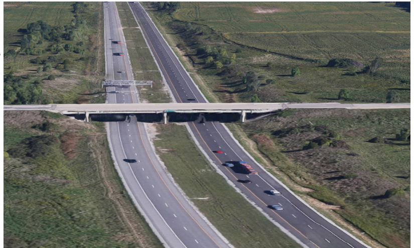
Above Picture: Tower Terrace Road / I-380

This update involves many jurisdictions and agencies, including: