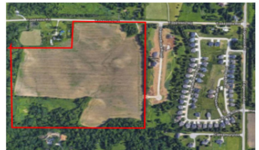
The Todd Hills Subdivision site (red outline) south of Todd Hills Road and west of Edgewood Road in Hiawatha

The first lots will be available in May. Walford-based Schrader Group has 600 acres under development in five other locations in Fairfax, Swisher, Walford, Ely and rural Linn County.