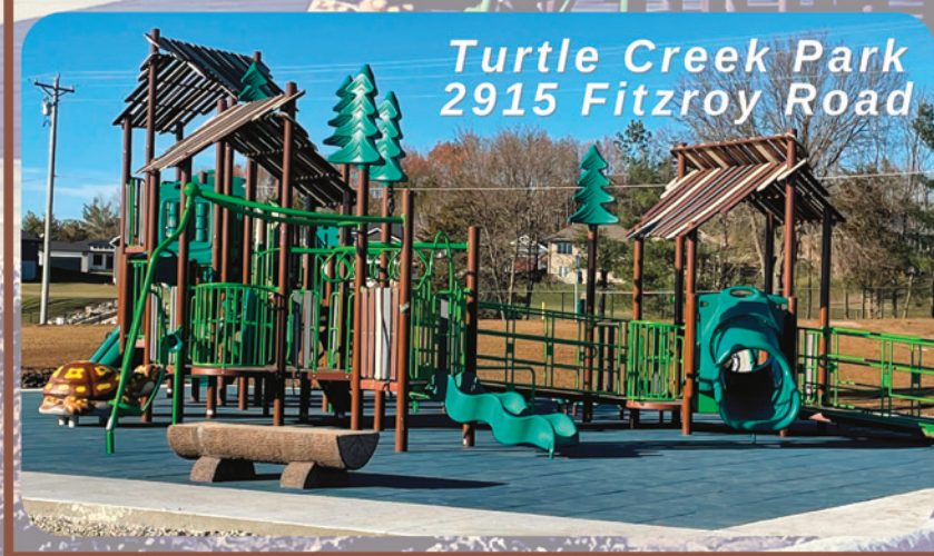
Turtle Creek Park 2915 Fitzroy Road

Restrooms at all Hiawatha Parks have been winterized and closed for the winter season. Temporary restrooms have been placed at Clark, Tucker, Turtle Creek and Guthridge Parks for your convenience.