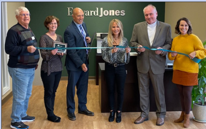
Edward Jones Ribbon Cutting 1713 Boyson Road, Hiawatha