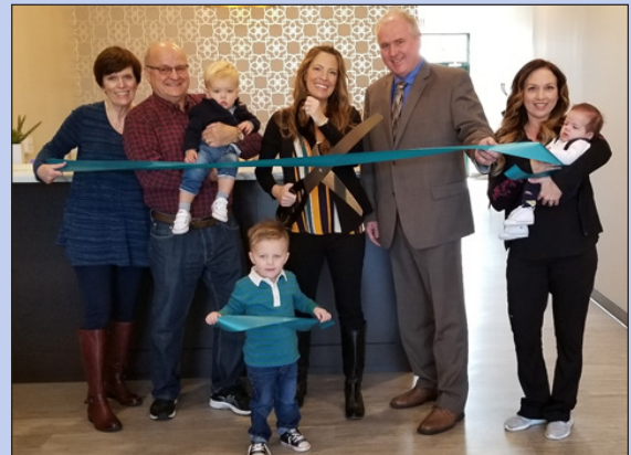
Hope Hearing & Tinnitus Center Ribbon Cutting 1727 Boyson Road, Hiawatha