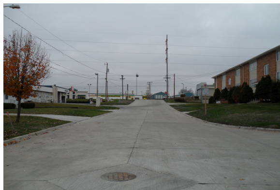
C Avenue from Blairs Ferry to Tucker Street