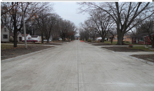
Third Avenue from Clark Street to Marion Street