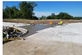
Heritage Green 12th Addition