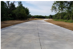
Dell Ridge Phase II

The construction is now complete on three new subdivisions in the City of Hiawatha. Dell Ridge 2nd Addition and Heritage Green 12th Addition add new residential lots. R&S Addition adds four new industrial lots. Construction of new residential homes and new commercial buildings continue at a fast pace and appears to be strong leading into 2017.