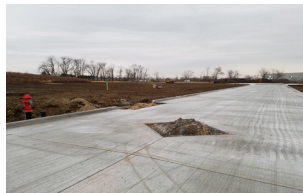
R&S First Addition