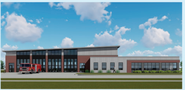
Preliminary Drawing of Station II