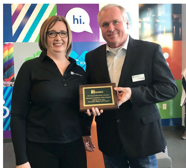
Unity Point Clinic Express Ribbon Cutting Ceremony February 29, 2020 Peck's Landing-1940 Blairsferry Road