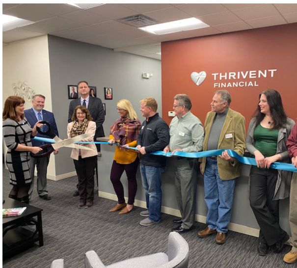
Thrivent Financial Ribbon Cutting Ceremony February 20, 2020 1625 Boyson Rd, Ste 100