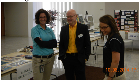
City Departments including Water, Public Works, Parks and Recreation, Police, Community Development, En-

City Staff, City Council and the Mayor held an open house in the Community Center on October 8 starting at 6:00 p.m. Hiawatha residents and members of the business community were invited to stop by to ask questions and find out what the City Departments are working on.