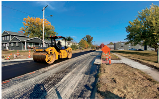
10th Avenue Overlay Project

Trail Connections - A new sidewalk was added along the west side of Edgewood Road, connecting Wolf Creek Trail to Grey Wolf. Installation was completed by individuals from Water, Public Works, GIS, and Engineering departments, saving the City a considerable amount of money thanks to their help. Soon a rapid flashing beacon crosswalk will be added to safely assist walkers across Edgewood Road to Clark Park.