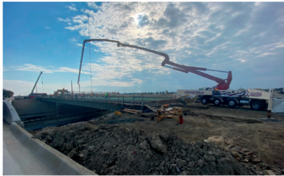
Tower Terrace Bridge Pour