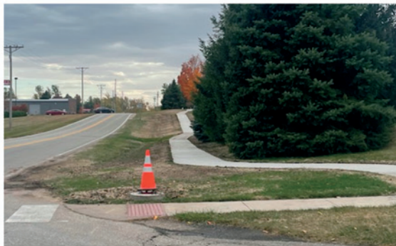
New Sidewalk along Edgewood Road