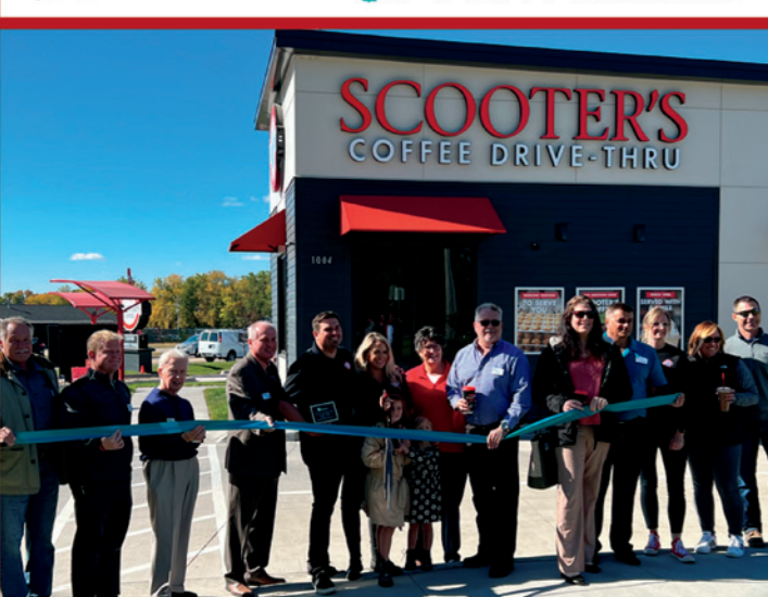
Visit Scooter's newest location at 1004 Robins Road