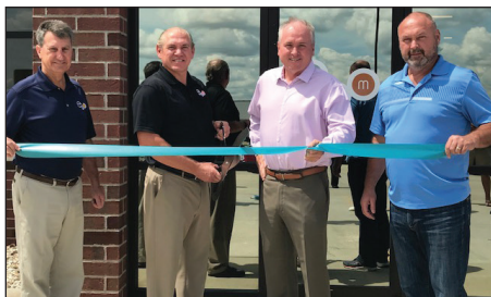
Eagle Technology Management 805 Tower Terrace Road