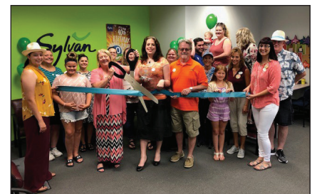
Sylvan Learning Center 1854 Boyson Road Celebrates 40 Years