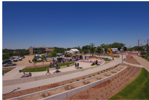
Village Center Plaza