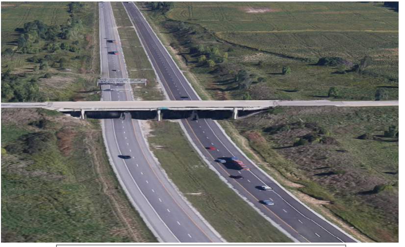
Above Picture: Tower Terrace Road / I-380

Included in this project is the estimated $20 million construction of the I-380/Tower Terrace Road Interchange, which is on track for construction by the Iowa Department of Transportation to begin in fiscal year 2022.