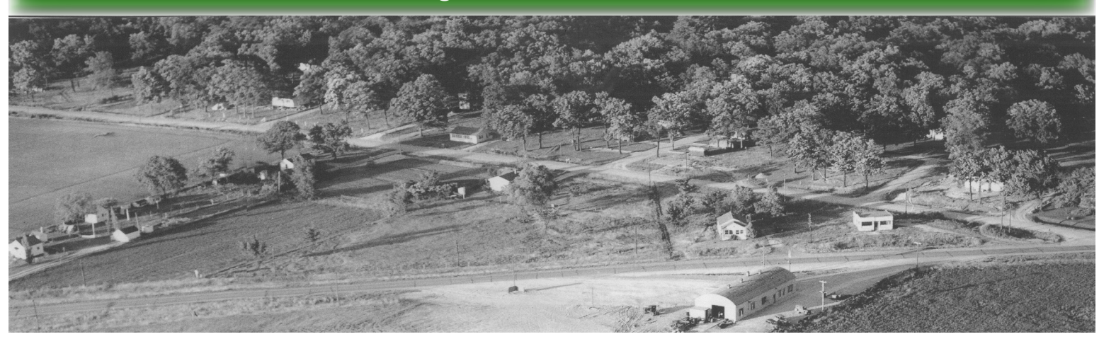
1947 Aerial Photo courtesy of Brian Fanton.

North Center Point Road and Robins Road. Quonset hut on Hwy 150.