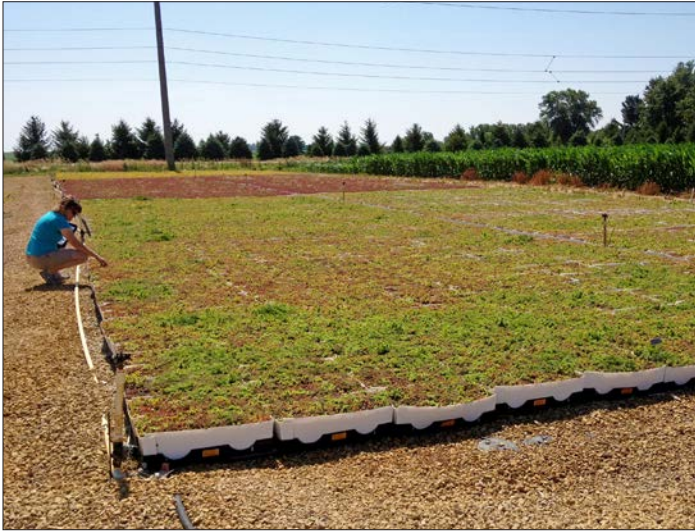
Sedum are custom grown in trays in an Iowa nursery.

There are two primary delivery and installation methods: in-situ and modular systems. In-situ or “built” up systems are constructed through a series of layers that are built-up on the roof deck using materials that arrive on-site in bulk. After placement of the components and soil media, the roof is vegetated by planting plugs, cuttings, or pre-grown mats. Modular systems or “trays” are mass produced in a nursery and individually placed on a rooftop in small 2’x4’ plastic units filled with growing media. Pre-grown plants are then set on top of the waterproofing membrane and root barrier.