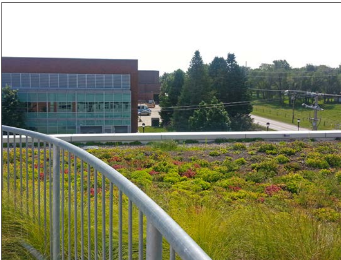
Semi intensive green roof at Central College in Pella supports more plant diversity.