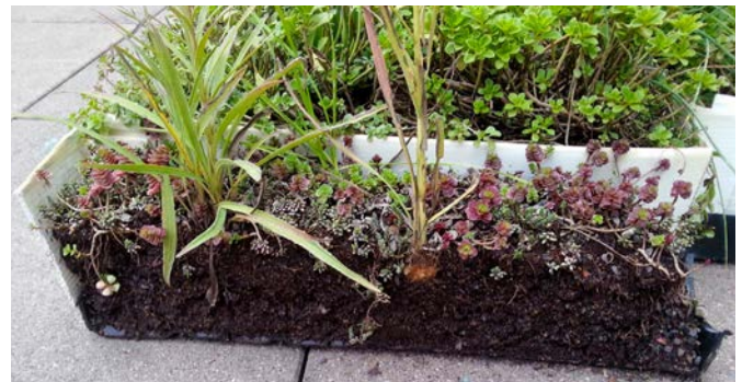
Cross section of an extensive green roof tray.