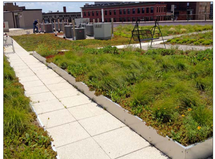
Quad Cities semi intensive rooftop has soil depths ranging from 4-8 inches.