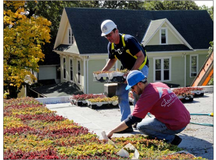
Sedum tray system is installed in Des Moines.