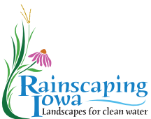
6 Cedar Rapids - Public Library